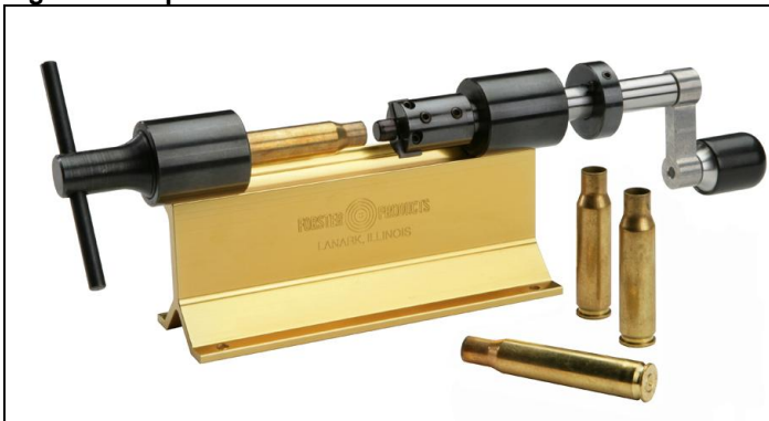
Figure 4. Prepared Cases