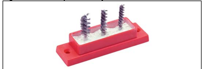
Figure 2. Case Graphiter Ready to Use

If desired for stability, use the pre-drilled mounting holes to fasten the base to a block of wood.