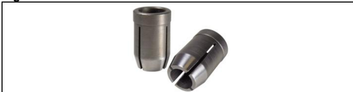
Figure 2. Collets