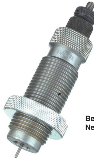
Bench Rest Neck Sizing Die

* Complete Neck Sizing Dies no longer available. Information provided only for customer support and replacement part ordering.