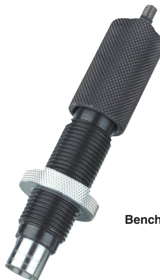
Bench Rest Seater Dies