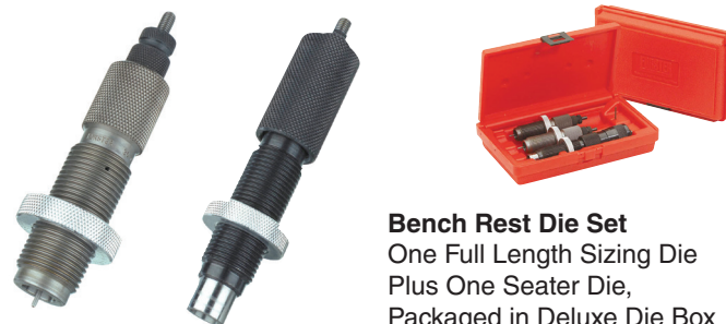
Bench Rest Die Set One Full Length Sizing Die Plus One Seater Die, Packaged in Deluxe Die Box