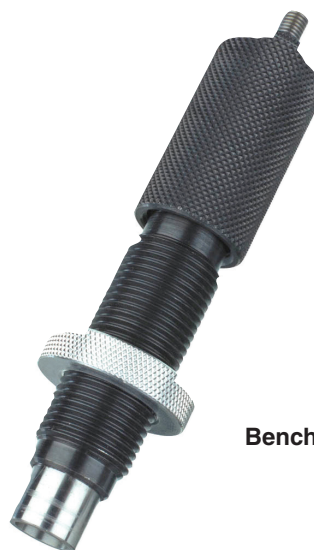
Bench Rest Seater Dies