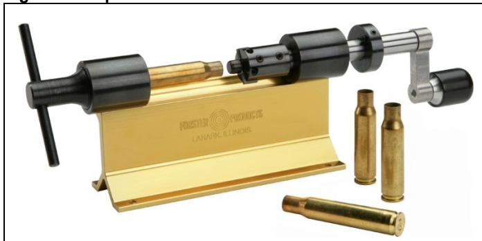
Figure 4. Prepared Cases