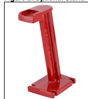
Figure 2. Optional Stand

The Bench Rest Powder Measure Stand (017941) securely holds the Powder Measure in place. See Fig. 2.