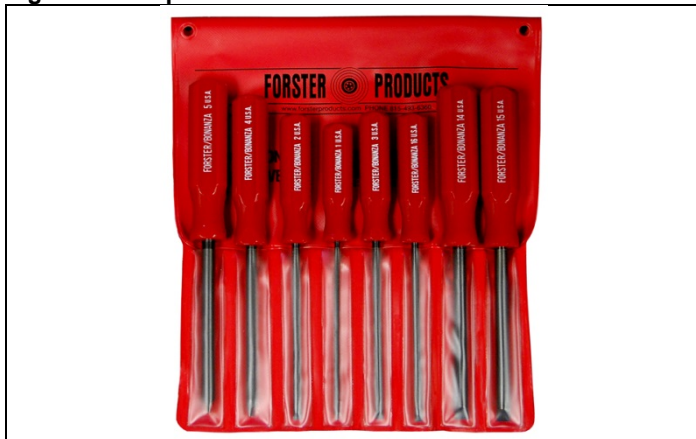
Figure 2. Complete Gunsmith Screwdriver Set