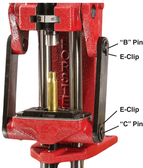
Figure 1. Links