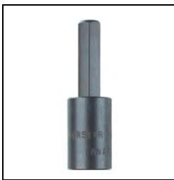
Figure 1. Power Adapter for Case Trimmers

The Forster Products Power Adapter for Case Trimmers (Fig. 1) provides a quick and affordable way to turn any of our miniature lathe Case Trimmers into a power Case Trimmer. It allows a cordless screwdriver or power drill to be used with any Forster Case Trimmer (Original, Classic, or 50BMG) and the Deburring Tool Base.