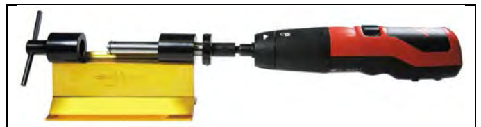
Figure 3. Power Adapter Shown on Cordless Screwdriver