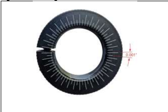
Figure 1. Accu-Ring Reference Marks

The distance of 0.001” is the distance between a long and short reference mark as shown in Figure 1. This distance indicates the up or down adjustment of the die in the Co-Ax® Reloading Press. Actual up or down movement of the die is 0.000998” per reference mark, which, for all intents and purposes, is one thousandth of an inch (0.001”).