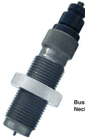
Bushing Bump Neck Sizing Dies